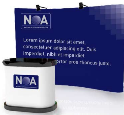
Example of Global Destinations Sponsor Booth

For a full list of benefits please see pages 4 and 5 Sponsor Package £7,000